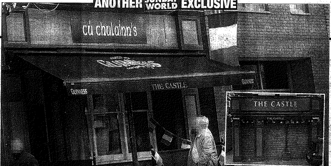
THREATS: Simpson family were run out of pub